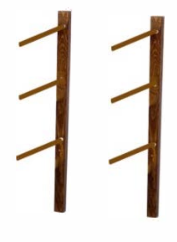
Follow the hanger bars. Connect the baskets to the hanğers.